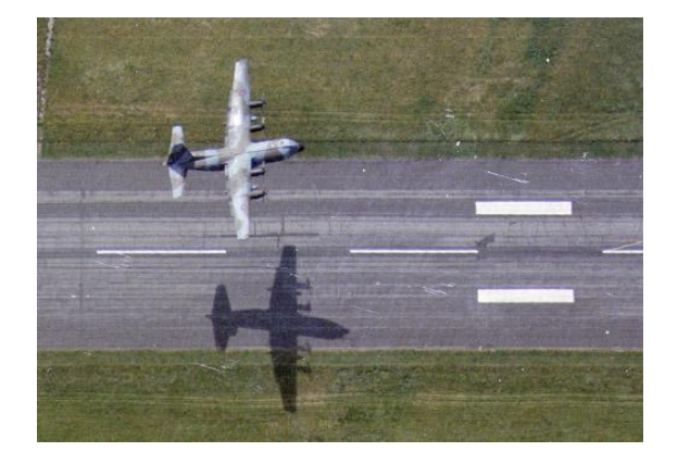
Royal Air Force Lockheed Hercules leaving Bournemouth Airport (NCAP-000-000-)

Dating from 1990-1994, the images cove locations from Dorset to Kent and from Swansea to Yorkshire.